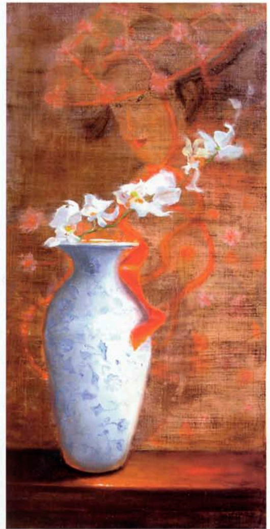
BEAUTY AND THE VASE, OIL ON CANVAS, 39 X 19"