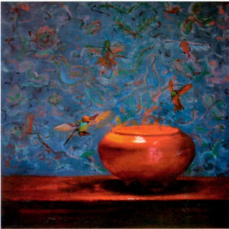
CALLING ALL HUMMINGBIRDS, OIL ON CANVAS, 24½ X 24½"