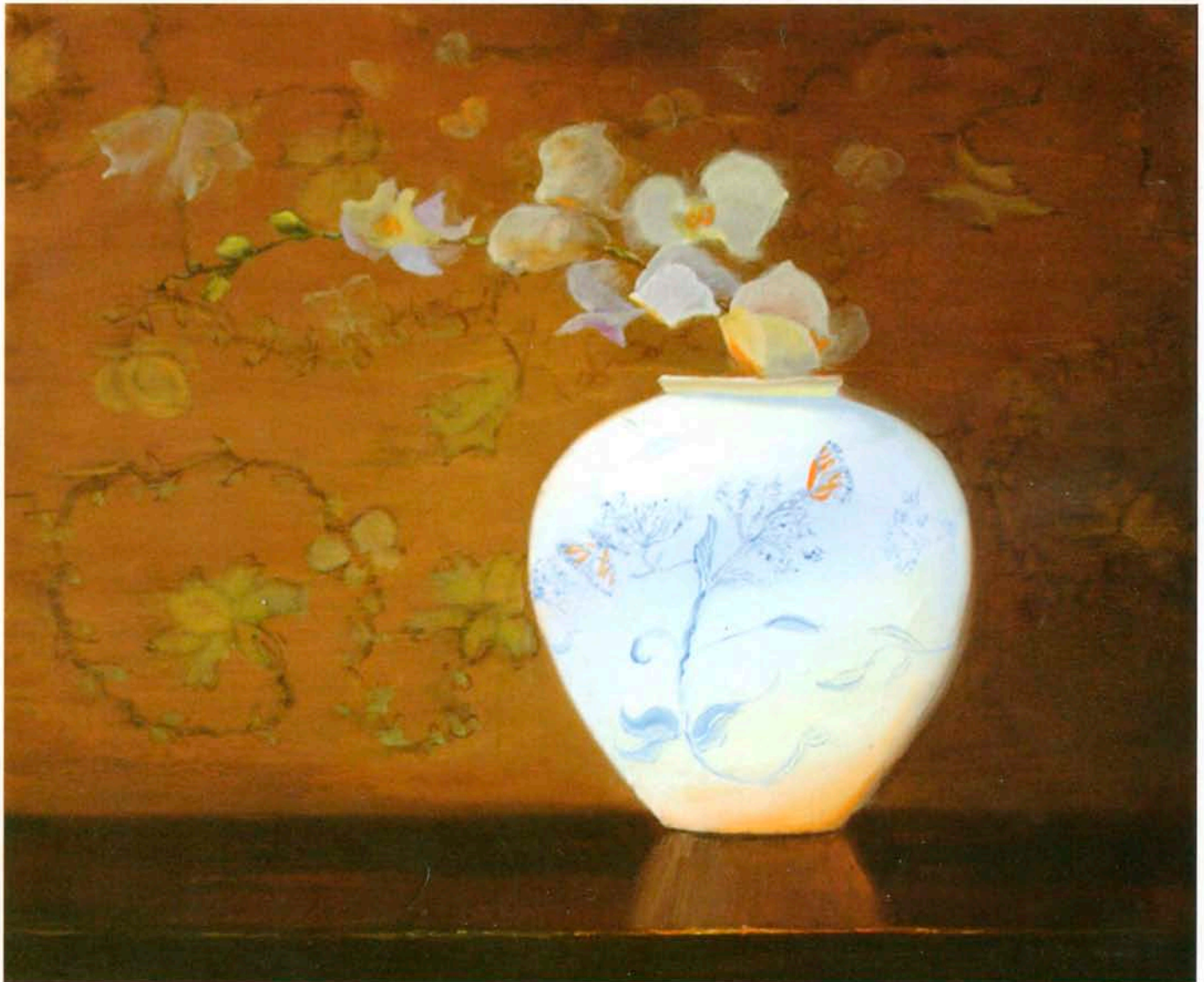
MOTH ORCHID, OIL ON CANVAS, 27½ X 31½"

an otherwise realistic setting, helps place the object in a place and time that describes its journey, beyond what may be found in a traditional still life. Things like a portion of the painting's background popping into the foreground or a historical map surrounding the object are some ways White brings magic onto her canvases.