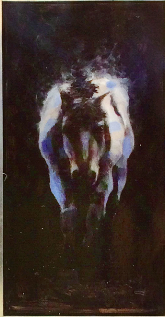
Ghost Horse II 39.5 x 21.5", oil on panel